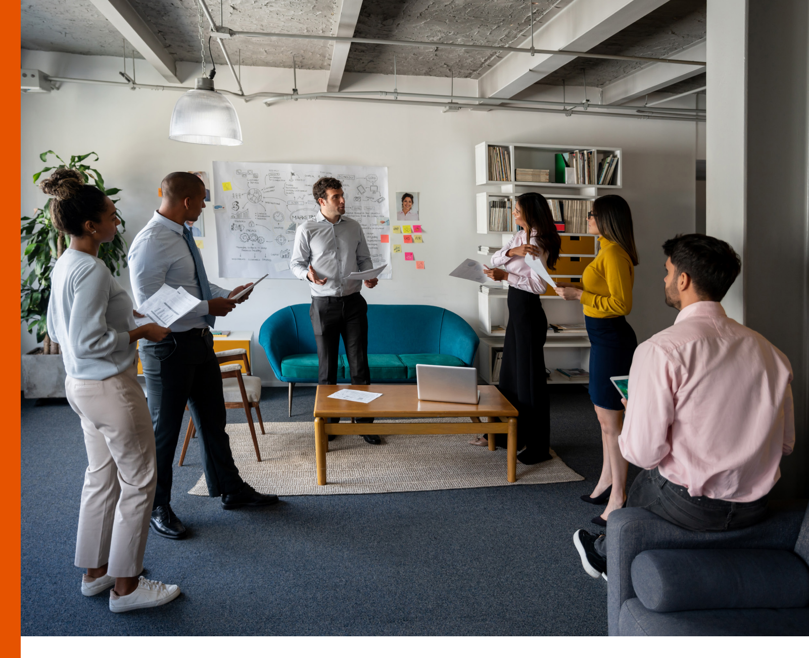
Organizational Innovation Dampeners